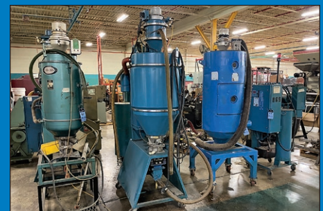
Plastic Auxiliary Equipment, Material Dryers, Sprue Pickers, Granulators