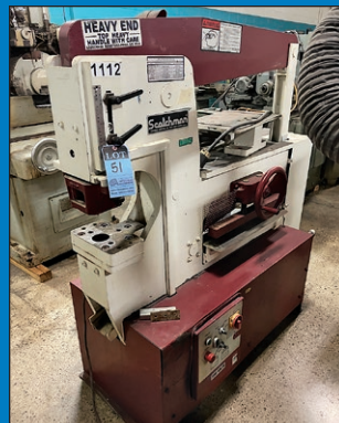
65 Ton Scotchman Ironworker