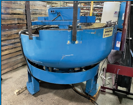
Roto-Finish Model MP-70 Vibratory Feed Bowl