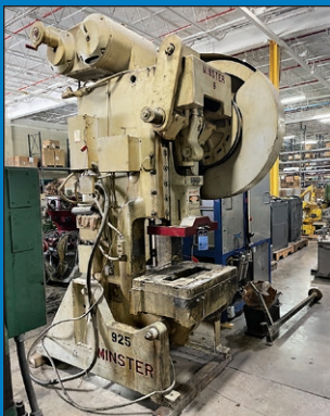
60 Ton Minster No. 6 OBI Press