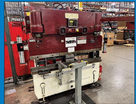
55 Ton x 6' Pacific Model J55-6 Hydraulic Press Brake