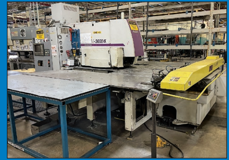
30 Ton Muratec Vectrum 3000 Alpha CNC Turret Punch