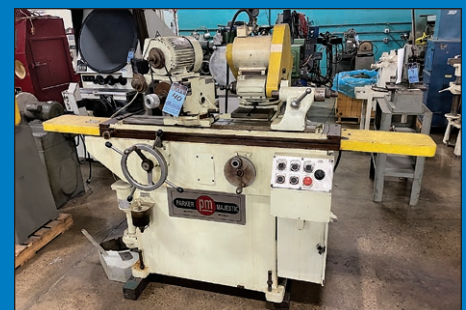
Parker Majestic Model 1C Universal ID OD Cylindrical Grinder