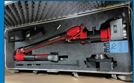
Romer Model 5124 CIM CORE Infinite 2.0 Portable Arm CMM