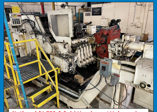
National S1 750-6 Cold Header w/ Universal Transfer