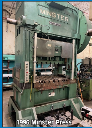
1996 Minster Press

Contact Information 2020 Dunlap St. Cincinnati, Ohio 45214 Phone 513-241-9701 Fax 513-241-6760 www.cia-auction.com