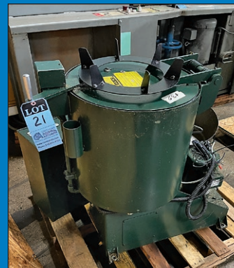
Barrett Chip Wringer